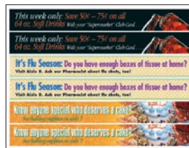
8.5" x 11" Card Stock